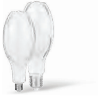
Petal ↪ P240