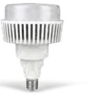
Doughnut ↪ P241