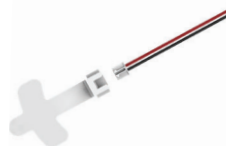
Self adhesive LED indicator pad