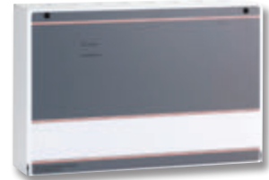
BF377 24V 2A UNREGULATED DOOR RELEASE PSU