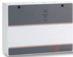
BF375M 24V 1A REGULATED PSU