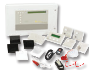
Addressable Call Systems