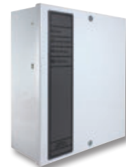
NC925B1 12V 1A WHITE BOXED PSU