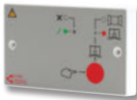
BF375PE 24V 250MA UNREGULATED DOOR RELEASE PSU C/W DETECTOR CIRCUIT