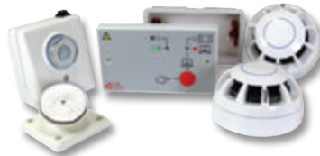
BF375PEK 24V 250MA DOUBLE GANG AUTOMATIC DOOR RELEASE SYSTEM