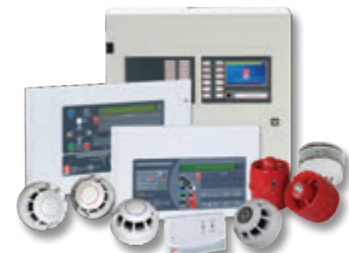
Addressable Fire Systems