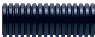
Type PA Heavyweight Conduit