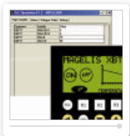
Simulator on PC