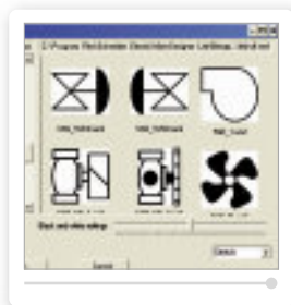
Graphic objects library