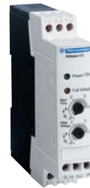
Altistart 01N1 from 3 to 25 A

For suppressing torque surges on starting (freewheel stop).