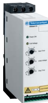
Altistart 01 model U from 6 to 32 A

For suppressing torque surges on starting, soft stopping... and for control at any instant of your application.