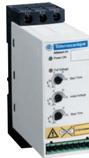
Altistart 01N2 from 6 to 85 A