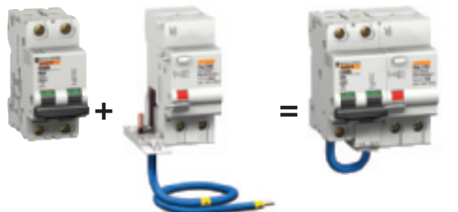
2P C60 circuit breaker