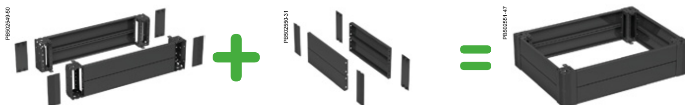
Plinth height 200 mm

The complete plinth consists of two elements, one is the front and rear kit, determined by the length of the enclosure, and the other consists of the side panels, which determine the depth of the enclosure. The number of side panels required is decided according to the desired plinth combination.