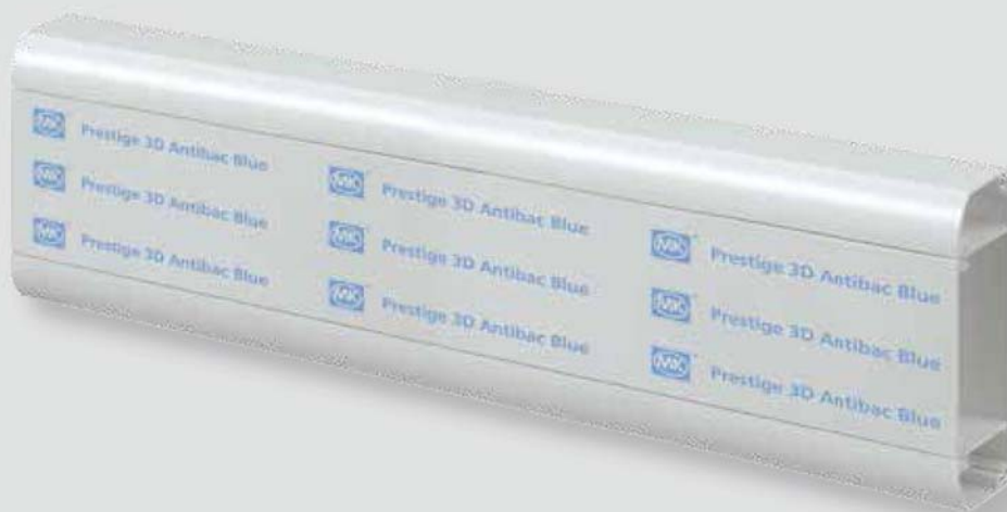
Prestige 3D Antibac Blue

The additive used in Prestige 3D Antibac Blue is registered with the Environmental Protection Agency (EPA) and is compliant with the European Biocidal Products Directive (BPD).