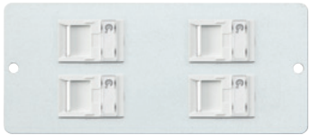
Populated with MK data modules