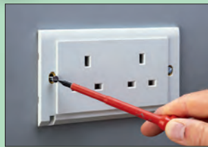
The interior of the product is screwed to the installation surface as with any standard accessory.