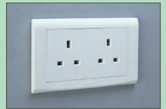
This is attached to the interior to complete the assembly.