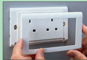
The clip on plate surround is supplied with the product.