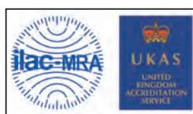
Testing Laboratory No. 1460 Testing Laboratory No. 2003

As a leading manufacturer of electrical installation equipment, Crabtree is committed to the continual improvement of all quality assurance procedures and performance.